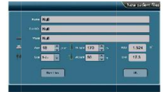
Patient Manage Interface

It has huge storage space; drug added can be recorded at any time; events also be recorded automatically and it can save 500 syringe records. The distinctive operation mode, a new tactile experience for users was aroused through operation combined touch screen, buttons and knob.