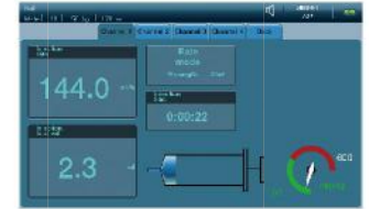
Big Font Display

Specific to different occasions and doctor's clinical practice and five injection modes has been designed. Includes speed mode, weight mode, time mode, intermittent mode of drug administration and TIVA mode. They complement each other, fully meet different clinical needs. Multi-channel syringe pump systems controlled via a central control platform and make its speed stable and ensure patient's safety.