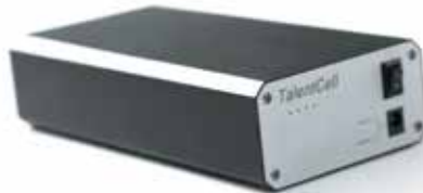
● Power Bank (D1402)