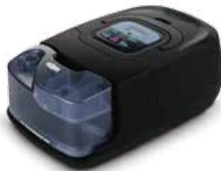
RESmart Auto CPAP System