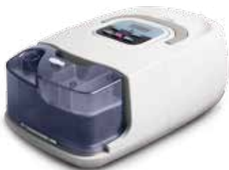
RESmart CPAP System