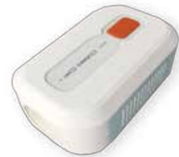
● Ventilator Disinfector