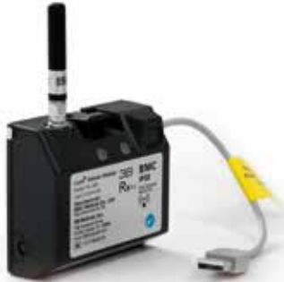
● GPRS / Wi-Fi Kit