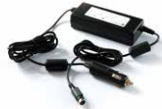
● DC/DC Converter