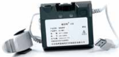
● SpO 2 Kit