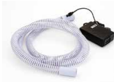
● Heated Tubing