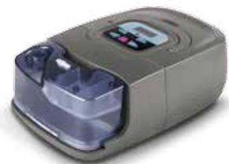
RESmart BPAP System