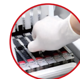
Step 2: Reagent cartridges loading